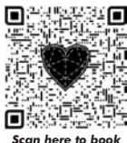
Scan here to book