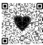
Scan here to book